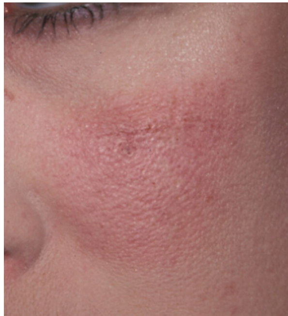
Figure 6. Tissue necrosis occurring after sclerotherapy for vessels on the face.

Management of extravasated sclerosing solution includes prompt dilution of the site. Dilution with hyaluronidase in normal saline has been shown to limit the extent and prevent cutaneous necrosis from 3% STS. 11 Hyaluronidase helps to prevent tissue necrosis through accelerated dilution, cellular stabilization, and improved wound repair, 12-15 although at least one study has shown that hyaluronidase solution must be injected within 60 minutes of extravasation to be effective. 16 Although hyaluronidase is supposedly ineffective when used more than 60 minutes after extravasation, it has been shown to be of value in avoiding tissue necrosis after the use of hyaluronic acid 17 even when the treatment had been