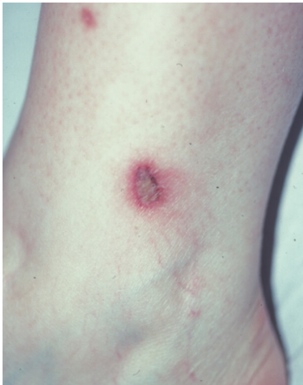
Figure 5. Tissue necrosis after sclerotherapy for telangiectasia below the ankle.

necrosis also occurs more commonly after sclerotherapy for vessels involving the medial malleoli, telangiectasia below the ankle (Figure 5), and on the face (Figure 6). 8-10 Nevertheless, prompt treatment is critical to avoid or lessen the potential for necrosis and nerve damage.