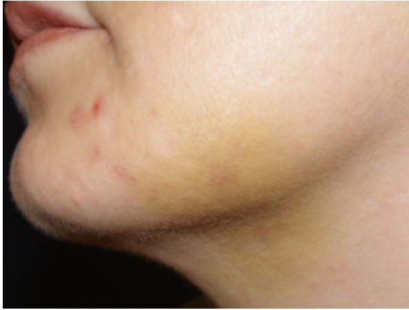
Figure 1. Examination on day 3.