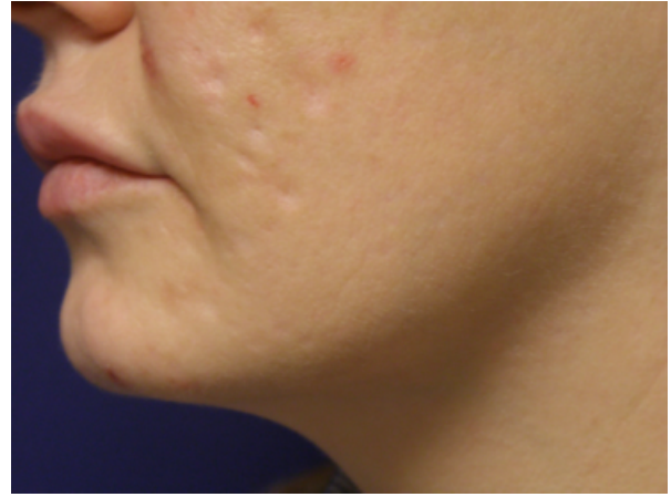
Figure 3. Examination on day 14.

sequelae. 4 In this case, cutaneous necrosis was likely avoided by rapid physiologic dilution of the hypertonic saline. Certain sclerosants are associated with a lower risk of cutaneous necrosis. Duffy has reported injecting 0.4 mL of 3% pol into his own forearm without ulceration (Figure 4). 5,6 Injection of STS into a nerve has also been reported to be painful and can result in anesthesia and sometimes permanent nerve impairment. 7 Multiple cases of inadvertent injection into a nerve have been reported with resulting variable degrees of nerve paralysis or paresis. 8