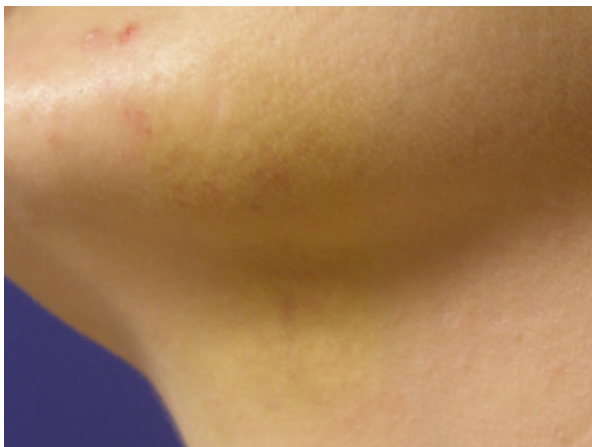
Figure 2. Examination on day 7.

types of sclerosants. It is common with hypertonic saline and high-strength sodium tetradecyl sulfate. Sodium tetradecyl sulfate 1% will cause contact ulceration, whereas sodium tetradecyl sulfate 0.2% is dilute and will not cause contact ulceration. Tissue